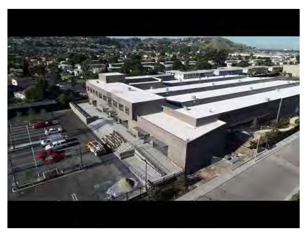
Watch Video At: https://youtu.be/-VYEUbLco40

5500 Jefferson is Steps from the Expo Line and Minutes from West LA Booming Media Hubs.